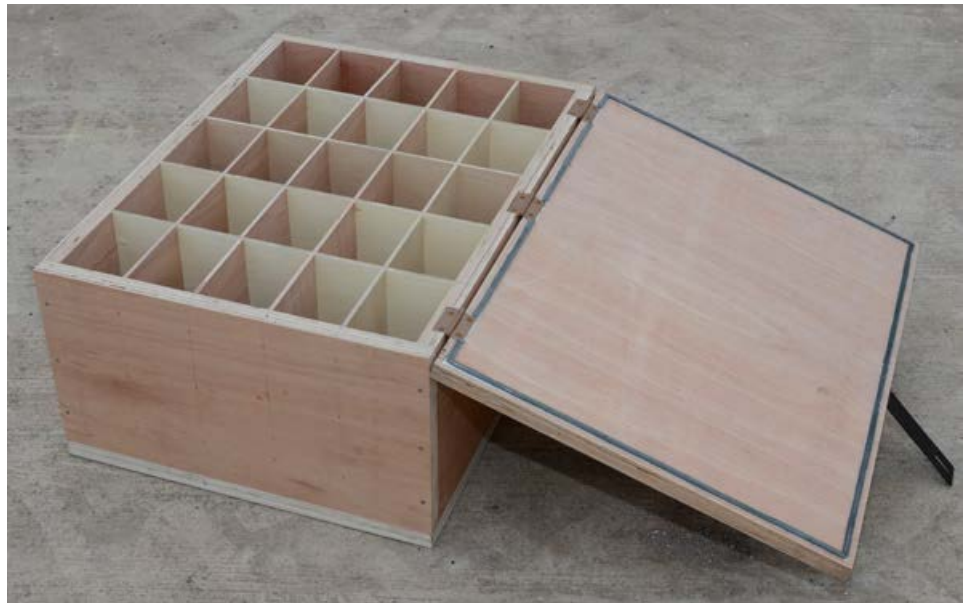
Figure 1 Storage of shooters' powder. Note intumescent strip on box lid

10 Boxes constructed in line with the findings presented in HSE research report RR991 6 can be used for the storage of between 1 and 25 (5 x 5) containers without being type tested. They are expected to provide at least eight minutes of fire protection to a box that is involved in a major conflagration.