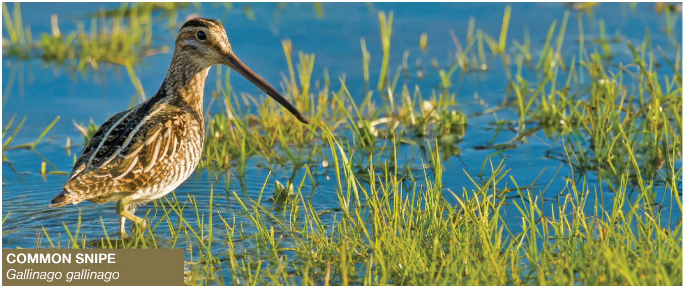
COMMON SNIPE Gallinago gallinago

Recommendation: delay shooting until September where resident breeding common snipe are present.